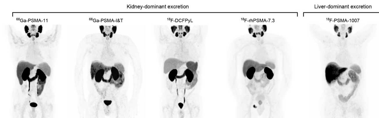
Fig. 1 Normal body distribution of PSMA-ligands. [ ^{68}Ga ]Ga-PSMA-11, [ ^{68}Ga ]Ga-PSMA-I&T, [ ^{18}F ]F-DCFPyL, and [ ^{18}F ]F-rhPSMA-7.3 applications lead to notable kidney uptake. Bladder retention is high for [ ^{68}Ga ]Ga-PSMA-11, [ ^{68}Ga ]Ga-PSMA-I&T, and [ ^{18}F ]F-DCFPyL and lower for [ ^{18}F ]F-rhPSMA-7.3. Reference organs for ligands with kidney-dominant excretion are liver and parotid

Usually, tumor lesions inside and outside the prostate gland show a high tumor-to-background ratio compared with the surrounding tissue [16, 62]. [ ^{68}Ga ]Ga-PSMA-11, [ ^{68}Ga ]Ga-PSMA-I&T, and [ ^{18}F ]F-DCFPyL are excreted primarily via the urinary system and collected in the bladder; a small proportion is cleared through the hepatobiliary system. Thus, small local recurrences might be missed if the SUV-threshold to judge the PSMA-ligand uptake in soft tissue structures near the urinary bladder is not adjusted properly. Hydration and/or the application of furosemide and/or repeat late acquisition may be useful in such cases.